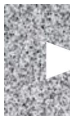
Undercut (Best Cut)